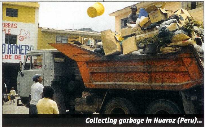
Collecting garbage in Huaraz (Peru)...

Last year, after a few conclusive experiences, Chapuis de-